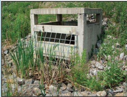
Rectangular weirs with side mounted trash rack