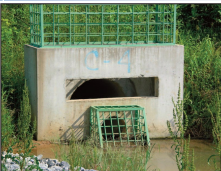
Rectangular weir & circular orifice with trash racks

The June 2022 updates to DM3 (Pub 13M) – Plans Presentation manual now stipulate PCSM plan format requirements and, most importantly, directs designers to use a standardized O&M statement for permitting use that points directly to Pub 888 instead of listing activities on the plan set. (Ref Pub 14M- DM3, Section 6.3). The new PCSM section in DM3 also provides direction on other PCSM plan set requirements for designers including presentation and content.