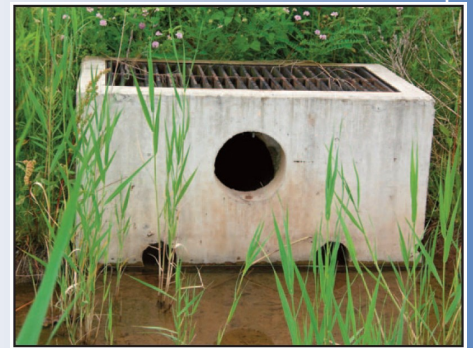
Circular orifices without trash rack