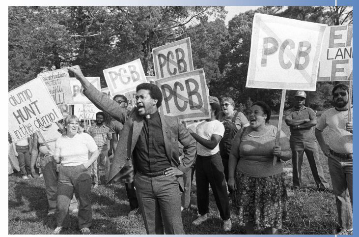
Marchers protesting the toxic waste dumping of PCB in Warren County, North Carolina (1982).

Executive Order (EO) 12898, was signed on February 16, 1994, and stated that federal agencies must identify and address disproportionately high and adverse human health or environmental effects of their actions on environmental justice communities, where EJ communities were minority and/or low-income populations.